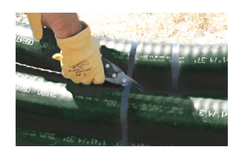
1 - Cut the three outermost fixing bands.

ThermoPEX comes pre-assembled and ready to install. No special tools or equipment are required. No drainage tile or gravel backfill is required. ThermoPEX only needs a narrow trench for installation. ThermoPEX is affordable and will reduce installation time, therefore saving you 25% to 40% on your installation costs.