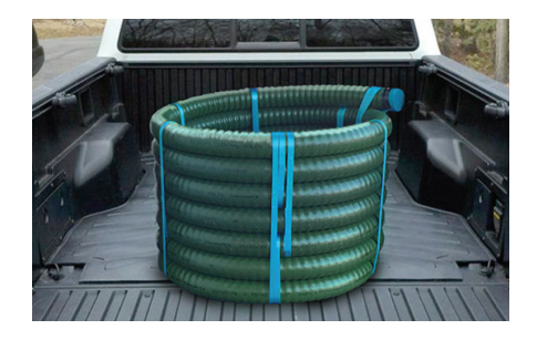
25 mm ThermoPEX is easy to transport.