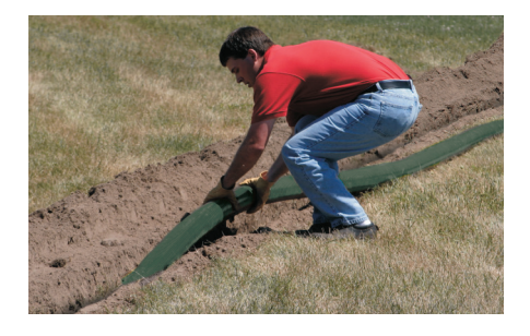
3 - Place ThermoPEX into trench.